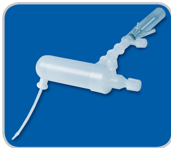
7700/7800/7900/8x00 PFA Inert Sample Introduction

Savillex worked very closely with Agilent to design an PFA inert kit that avoids the common problem of droplet formation in the connector tube, which causes instability and can even extinguish the plasma. The connector tube is an easy push fit design and the end cap is o-ring free to minimize contamination and features a make-up gas port. The demountable torch uses an o-ring mount, which ensures a correct fit with the torch and allows it to be easily dismantled. Injectors are available in either sapphire or Pt, with 2.5 mm ID. Versions for organic sample analysis are available, featuring smaller diameter 1.5 mm injectors, and a gas port for O 2 addition. All parts that come into contact with the sample come precleaned, ready for immediate use. Savillex inert kits are supplied with a genuine Agilent quartz torch and are exactly as supplied as original equipment with the 7500, 7700, 7800, 7900 and 8x00 Series. These kits are the highest performing inert kits available for ICP-MS, and used by all leading semiconductor labs around the world. Choose one of the kits below and add one of the Savillex nebulizers to make a complete inert sample introduction system.