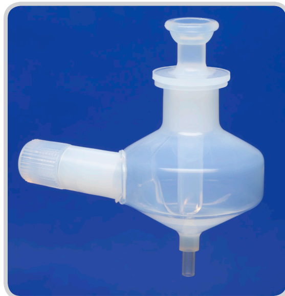
Savillex PFA Cyclonic Spray Chamber

The Savillex PFA cyclonic spray chamber (CSC) for ICP-MS is manufactured using Savillex's unique stretch blow molding technology, which gives it performance advantages over other inert spray chambers. Unlike other inert cyclonics, which are manufactured from individual machined parts that are assembled or welded together, stretch blow molding allows the Savillex PFA CSC to be molded in an optimum cyclonic shape similar to the traditional shape of a glass or quartz cyclonic. A deep spoiler is molded into the side walls, which improves signal stability and prevents re-nebulization, while a drain guide on the baffle tip promotes smooth draining. Stretch blow molding produces an extremely smooth surface finish, which also improves draining, and its translucent walls allow the user to see inside the chamber during operation. An optional version of the Savillex PFA CSC features a proprietary, organic based surface treatment for improved wettability, which in turn improves aerosol transport efficiency and therefore sensitivity. For a more detailed explanation of the design features of the Savillex PFA CSC, see Savillex Data Sheet DS008. The performance of both versions of the Savillex PFA CSC (surface treated and untreated) was compared to a PFA cyclonic spray chamber from another manufacturer, using ICP-MS. Both versions of the Savillex PFA CSC demonstrated superior signal stability and sensitivity.