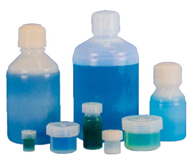
Purillex family of Jars, Bottles, and Vials

<u>Click here</u> to learn more and shop Purillex container products on our website!