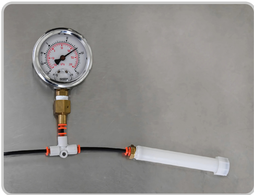
Pressurized integrity testing of Purillex containers

Currently, there are several direct and indirect methods for testing container integrity. Direct methods include pressure decay testing, burst testing, and helium leak testing. Other methods can include dye-penetrant testing, bacterial ingress testing, and container sterility testing. However, these methods are often not as precise, open to interpretation, and can be prone to operator error.