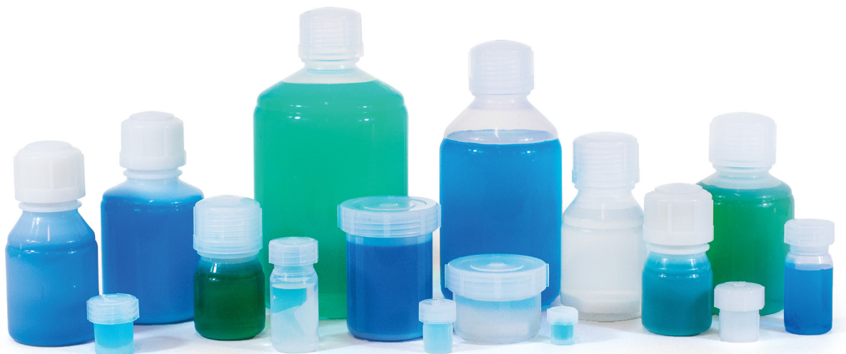
Family of Purillex life science containers

Container integrity testing is crucial to ensure container integrity and protection of critical solutions. The three testing methods outlined in this technical note are routinely performed on Purillex PFA containers to ensure consistency, reliability, and product security during use.