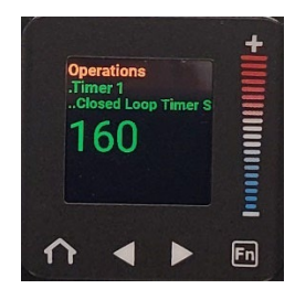
Figure 3. High temperature setting for timed heating cycle

2. Toggle the Forward Arrow Key three times to display the high temperature screen as indicated by the digital readout Closed Loop Timer SP (Figure 3). Use the Numeric Slider or + and - Keys to set the desired high temperature setting. The high temperature setting is the temperature that the HPX will heat to and maintain during the timed heating cycle.