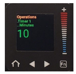
Figure 5. Digital minute readout for timed heating cycle

Keys to set the number of minutes (up to 59) for which the countdown timer will hold high temperature setting.