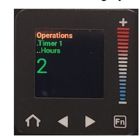
Figure 4. Digital hour readout for timed heating cycle

3. Press the Forward Arrow Key to display the hour screen as indicated by the digital readout Hours (Figure 4). Use the Numeric Slider or + and - Keys to set the number of hours (up to 99) for which the countdown timer will maintain the high temperature setting.