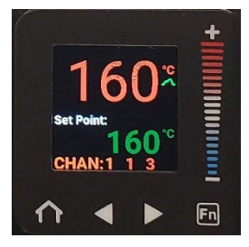
Figure 6. Home screen with green profile icon

7. When the HPX temperature is within ±5°C of the high temperature setting a green profile icon appears on the home screen indicating that the timer countdown is in progress ( Figure 6 ).