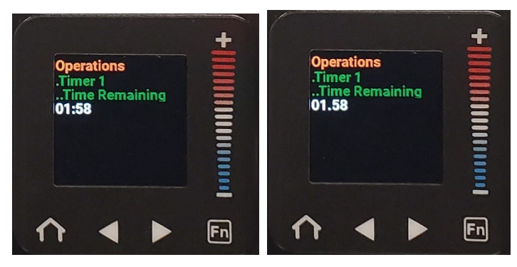
Figure 7. Time Remaining display with flashing colon mark

8. Press the Forward Arrow Key two times to see the length of time remaining in the timed heating cycle (hours:minutes). A flashing colon mark in the Time Remaining display indicates that the timed cycle is running (Figure 7) .